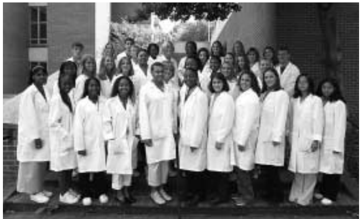
The 2002 Nursing Exploration Week participants represent 29 NC counties.

The program she created served 36 high school students from across the state who were interested in healthcare careers. For one week each summer, the chosen participants came to the Carolina campus to live in a college-like setting and shadow individual nurse mentors at