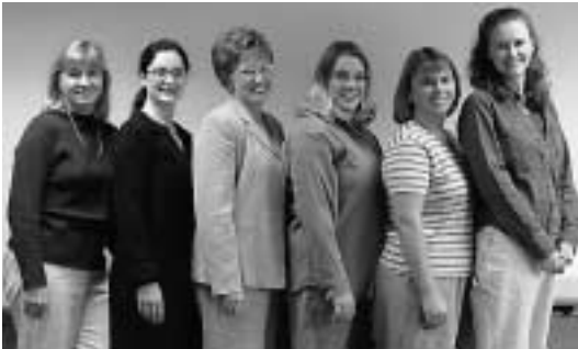
Department of Continuing Education

The School of Nursing received notice in May of several accreditations. From the Commission on Collegiate Nursing Education, the School's baccalaureate and master's degree programs were granted approval for the maximum