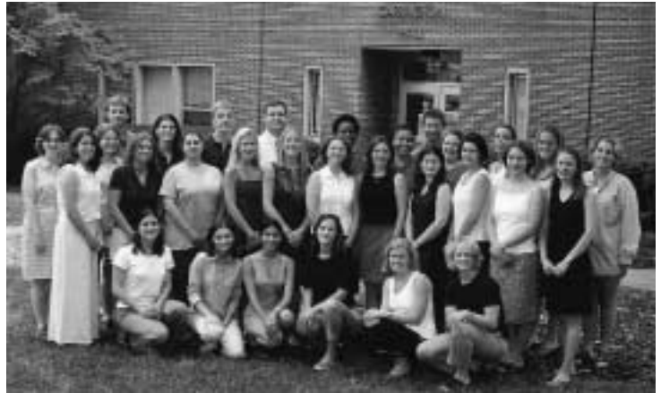
The School of Nursing's first 14-Month Second Degree BSN Option students are the state's first accelerated nursing program graduates.

The 31 students worked closely with faculty and staff to complete a rigorous schedule that included